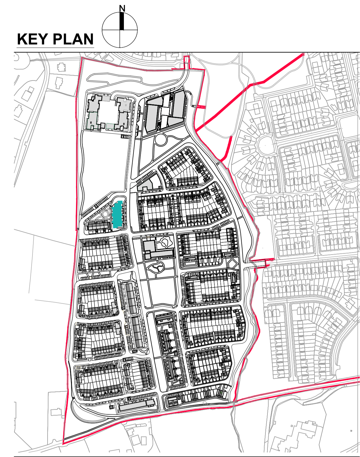
DUPLEX BLOCK E